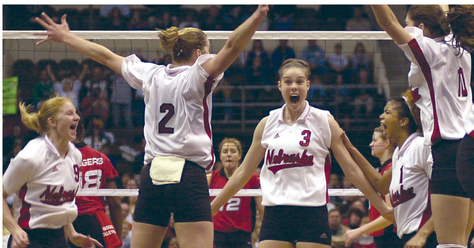
The Huskers celebrate match point against Wisconsin to win the 2000 NCAA title. Nebraska went 34-0 to earn its second national title.